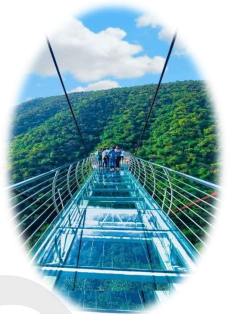
BIHAR GLASS BRIDGE